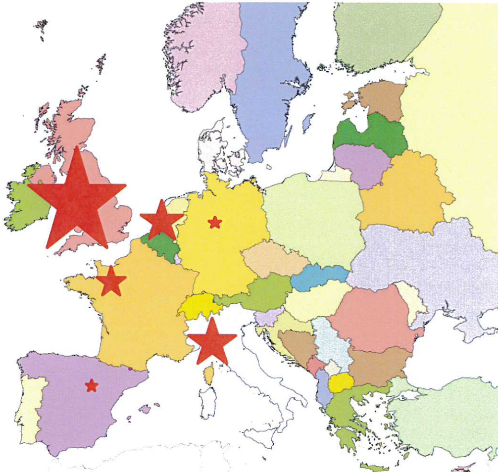
(Size of star depicts relative scale of supply chains to Kettle Foods Ltd)

Where our suppliers are not currently linked to our business on SEDEX or registered on SEDEX, then they are required to complete our Ethical Supply Questionnaire and are encouraged to register. Our direct supply chains include the sourcing of raw materials related to the manufacture of our products, as well as finished goods from our co-manufacturing partners. These supply chains stretch across Europe including, Italy, Spain, Germany, France, The Netherlands and UK.